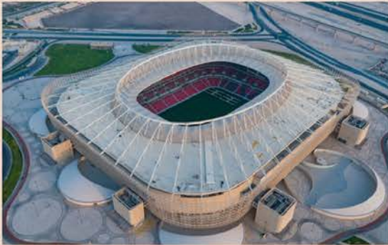
Ali Bin Ali Stadium | Capacity 40,000 Seats