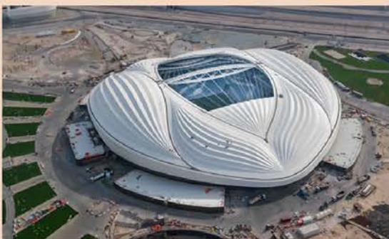
Al Janoub Stadium | Capacity 40,000 Seats