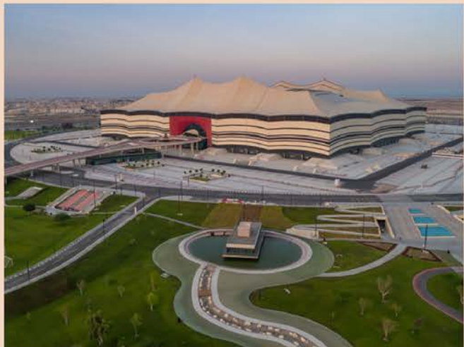
Al Bayt Stadium | Capacity 60,000 Seats