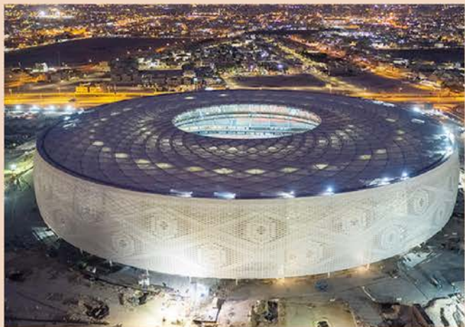
Al Thumama Stadium | Capacity 40,000 Seats