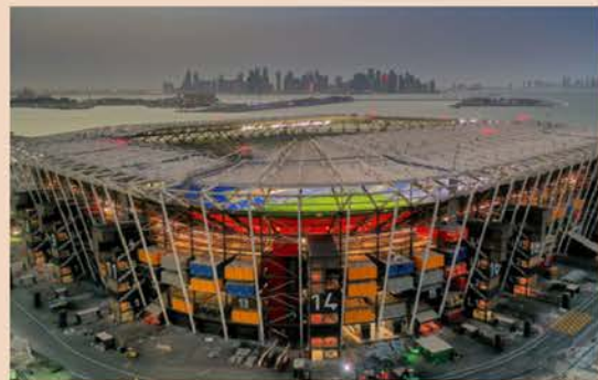
Stadium 974 | Capacity 60,000 Seats