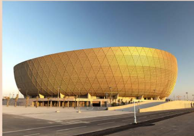
Lusail Stadium | Capacity 80,000 Seats