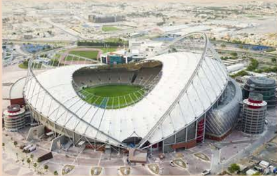
Khalifa International Stadium | Capacity 40,000 Seats