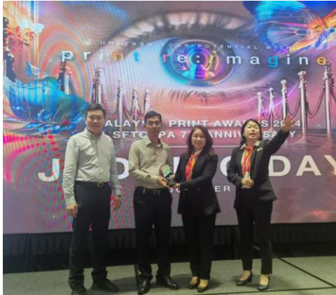
Judges of Malaysia Printing Competition