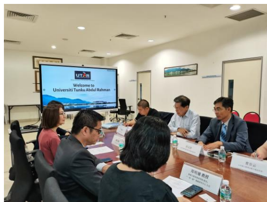
UTRA Exchange Seminar