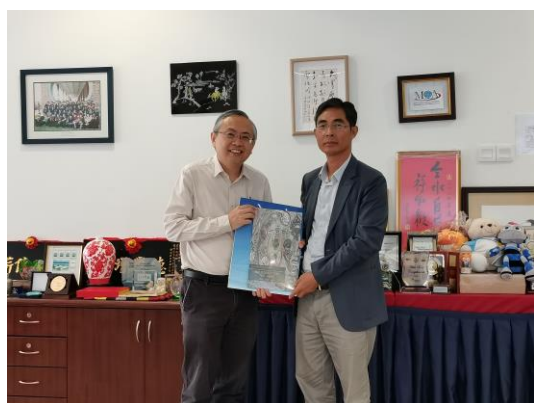
President of Tunku Abdul Rahman University AETDEW Fellow