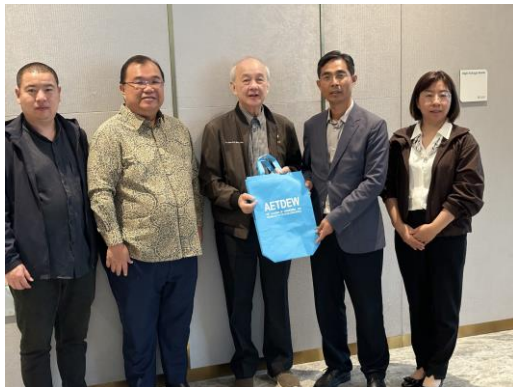
AETDEW Vice Chairman and Secretary General