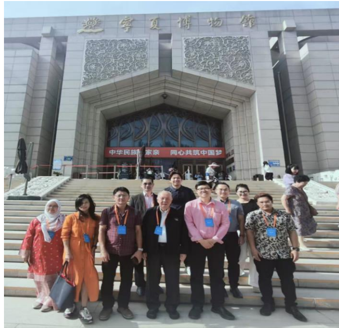
With Owner of Goji Farm and Goji Products Research and Development Institute